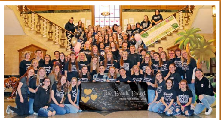
Pictured are students and staff at Mexico High School who participated in this year's True Beauty Project.

A video about this year's project can be viewed on the MACS website, www.mexicocsd.org .